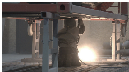
Blasting with Grittall