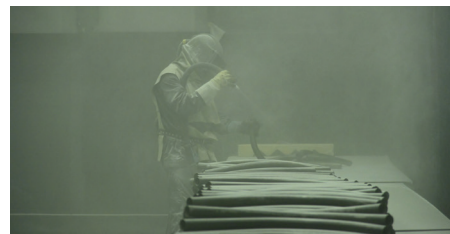
Blasting with mineral abrasives